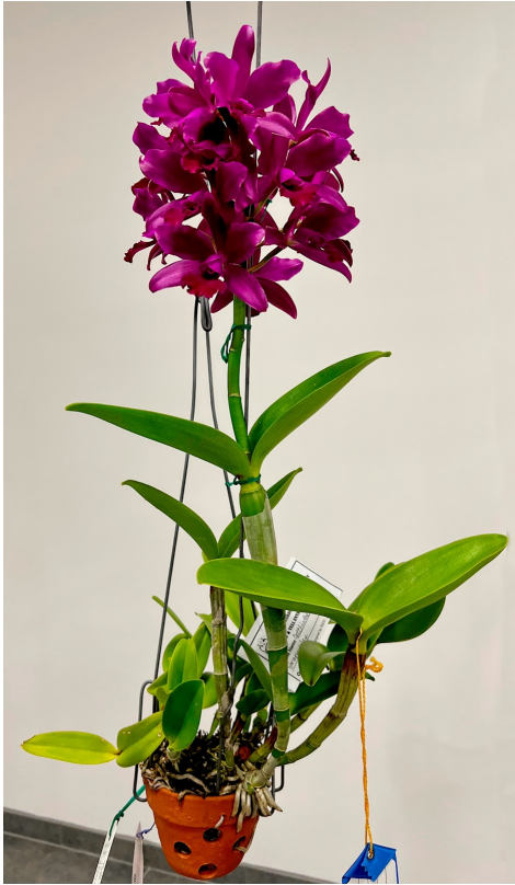
1st Place Speaker's Choice Cattlianthe Bacti 'Grape Wax' A hybrid Grown by: Sandi Block-Brezner

Congratulations to our winners and thanks to everyone who brought in a blooming orchid from their collection. We are excited to share your selections as Members Choice Award recipients during last month's contest. In case you weren't able to attend, here are photos of the selected winners. Bring in your blooming orchid to be considered in next month's display.